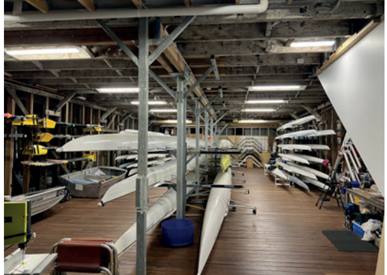
Increased headroom and doubled usable boat storage space