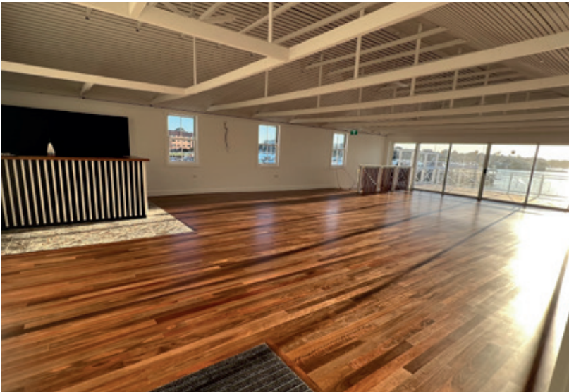
Renovated club hall