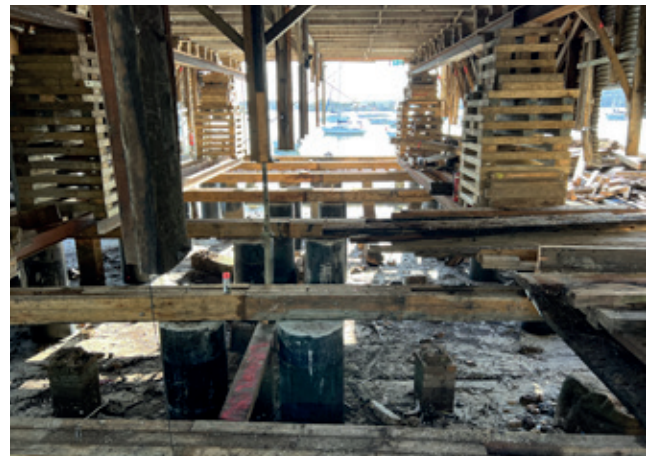
Raised pilons to protect the club from future rising sea levels