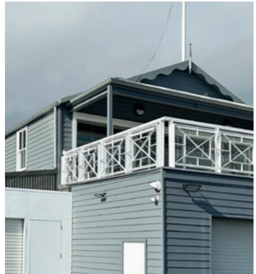
Restored heritage features