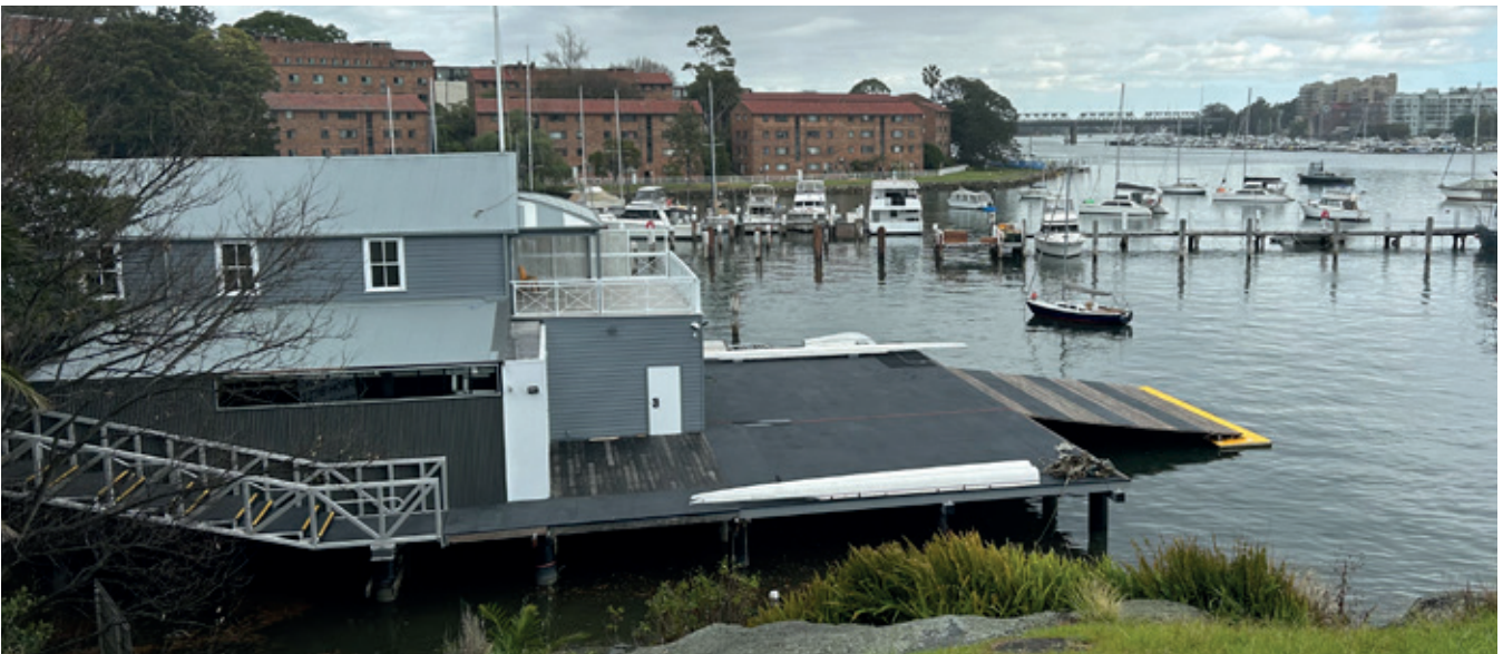
Increased 200sq. metres of staging area