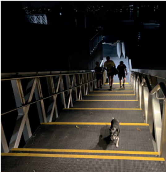
New side access with lift and sensor lighting