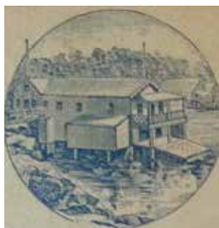
Balmain Rowing Club - 1891